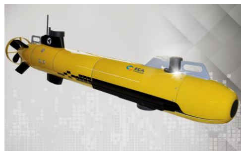
Smart Safety Systems